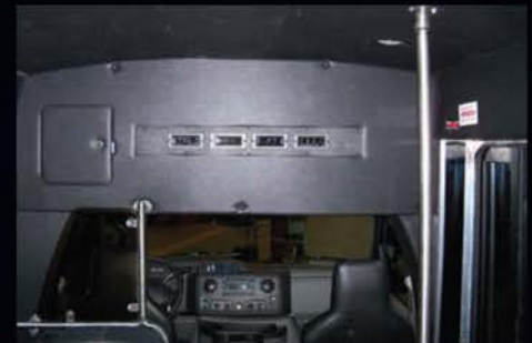
Black vinyl interior with optional drive modesty panel, stanchion and tinted plexiglass panel for added privacy