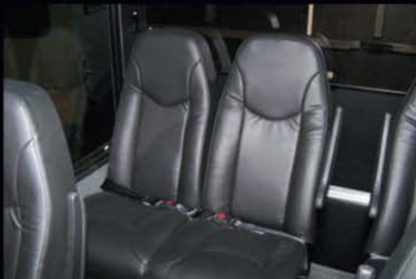
Black executive-style Berkshire seating