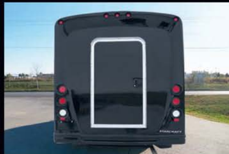
Stylish fiberglass rear cap with rear luggage access door