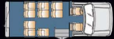
11 Passenger Plus Rear Luggage 138" WB SRW