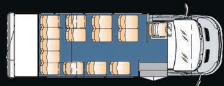
14 Passenger Plus Rear Luggage Plus Driver