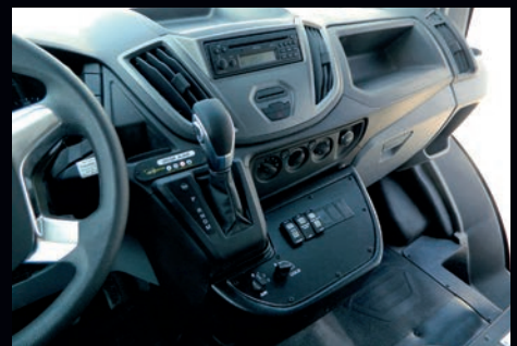
Attractive and convenient driver control panel