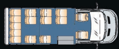
14 Passenger Plus Driver

Starcraft Bus, a division of Forest River, Inc., is owned by Berkshire Hathaway, one of the most respected and financially secure companies in the industry.