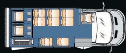
8 Passenger Two Wheelchairs Plus Driver