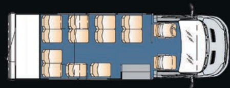
13 Passenger Plus Rear Luggage Plus Driver