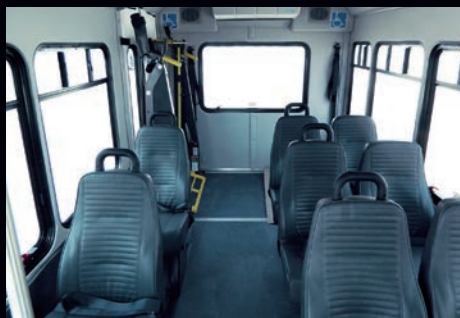
Spacious interior with high-back seats and overhead luggage rack