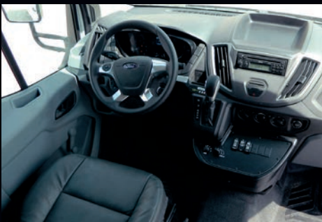
Comfortable and easily-accessible driver's area